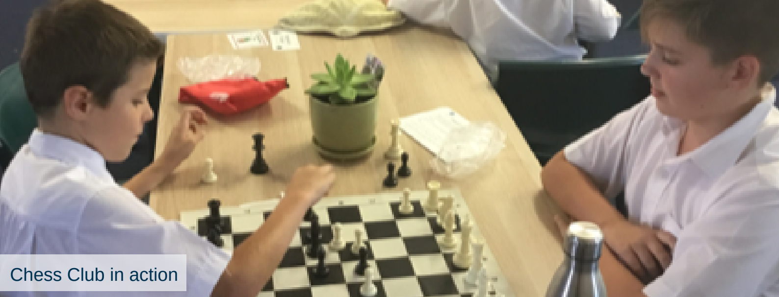
Chess Club in action