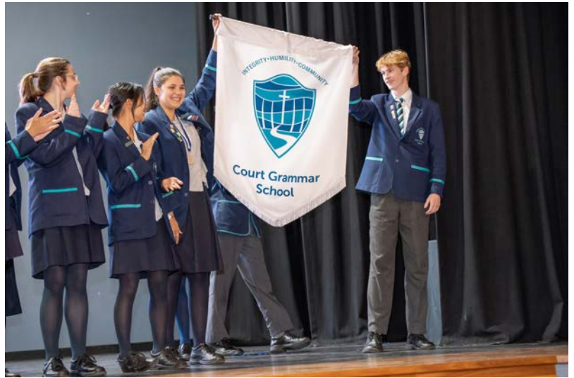
Our 2023 Student Leaders receiving the School flag.

They will be officially badged at the Sir Charles Court Futures Assembly early next year. Congratulations to all.